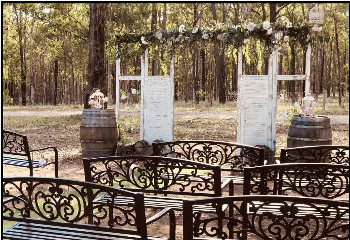
The Marrying Tree at Kookaburra Hideaway